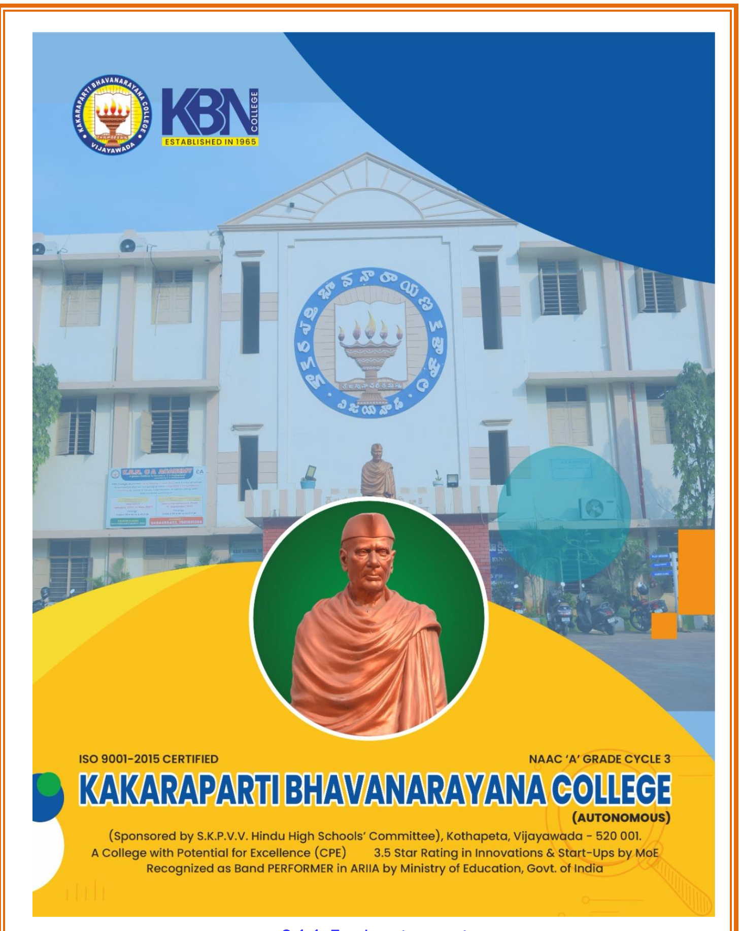
2.1.1: Enrolment percentage